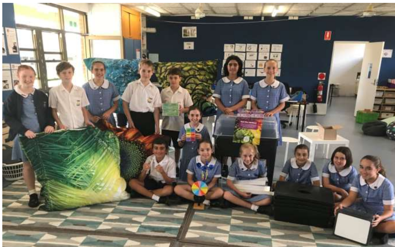
Year 6 students with some of the classroom resources

Learning excellence in a caring community